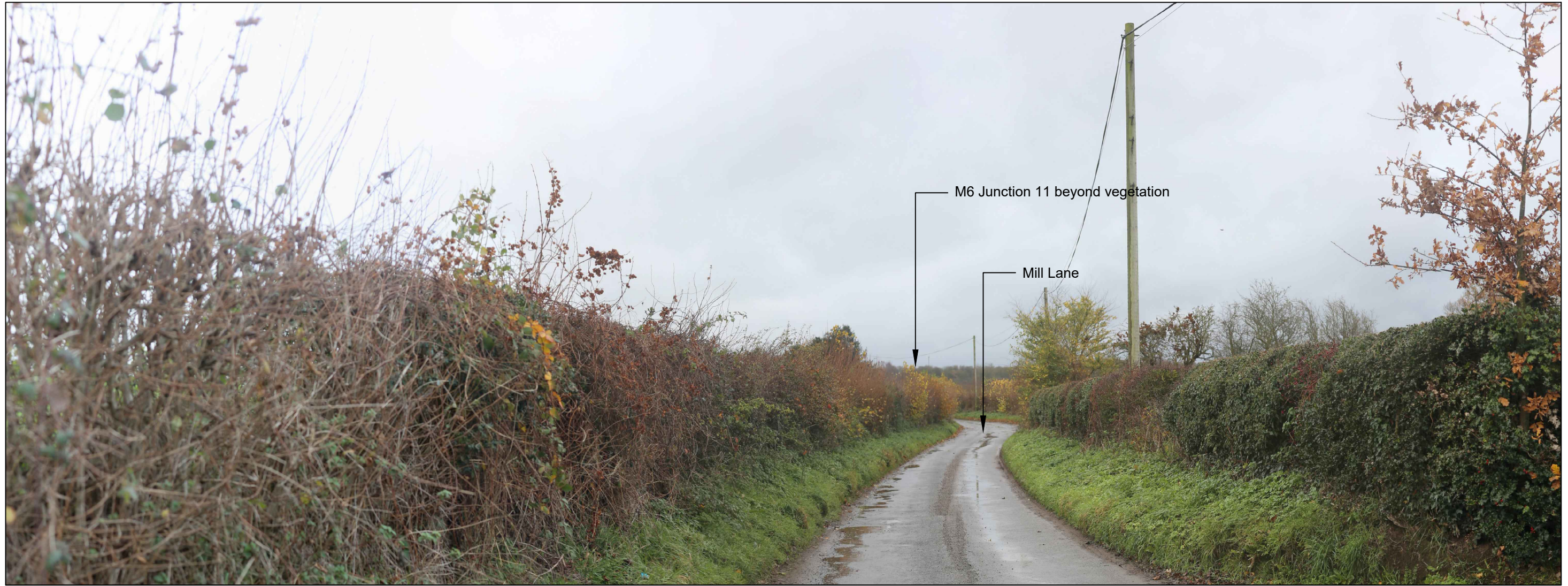
Extent of 50mm single frame image

Viewpoint number: 9 Location title: View from Mill Lane, Little Saredon Camera model: Canon EOS 6D Focal length: 50mm Field of View: 65° (Horizontal) Camera height: 1.6m Photo taken: 20/11/2018 Coordinates: 395065, 307133 Elevation: 127m AOD