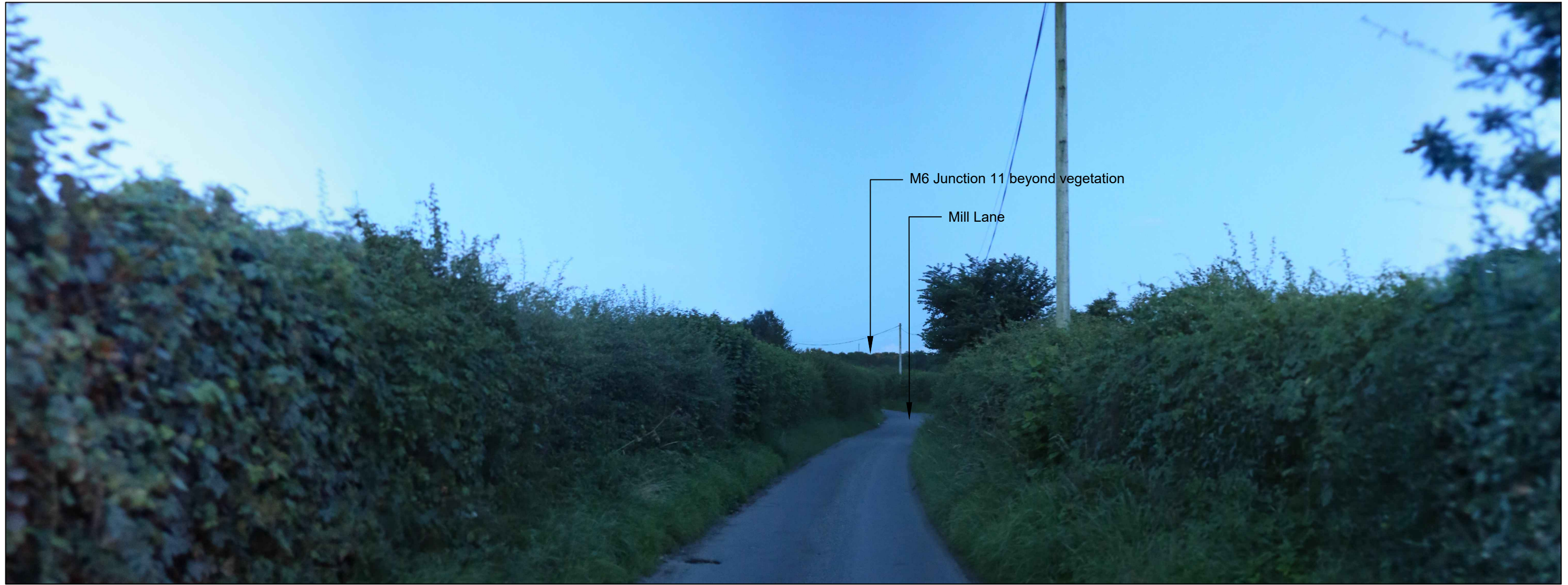
Extent of 50mm single frame image

Viewpoint number: 9 Location title: View from Mill Lane, Little Saredon Camera model: Canon EOS 6D Focal length: 50mm Field of View: 65° (Horizontal) Camera height: 1.6m Photo taken: 12/08/2019 Coordinates: 395065, 307133 Elevation: 127m AOD