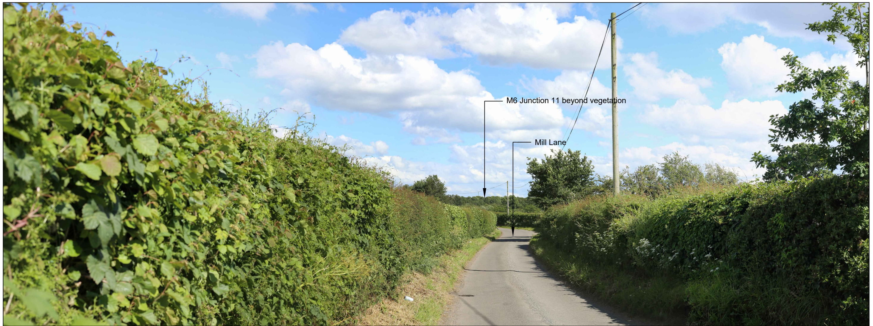
Extent of 50mm single frame image

Viewpoint number: 9 Location title: View from Mill Lane, Little Saredon Camera model: Canon EOS 6D Focal length: 50mm Field of View: 65° (Horizontal) Camera height: 1.6m Photo taken: 20/06/2019 Coordinates: 395065, 307133 Elevation: 127m AOD